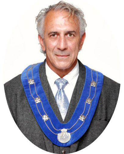
Mayor Sid Tobias